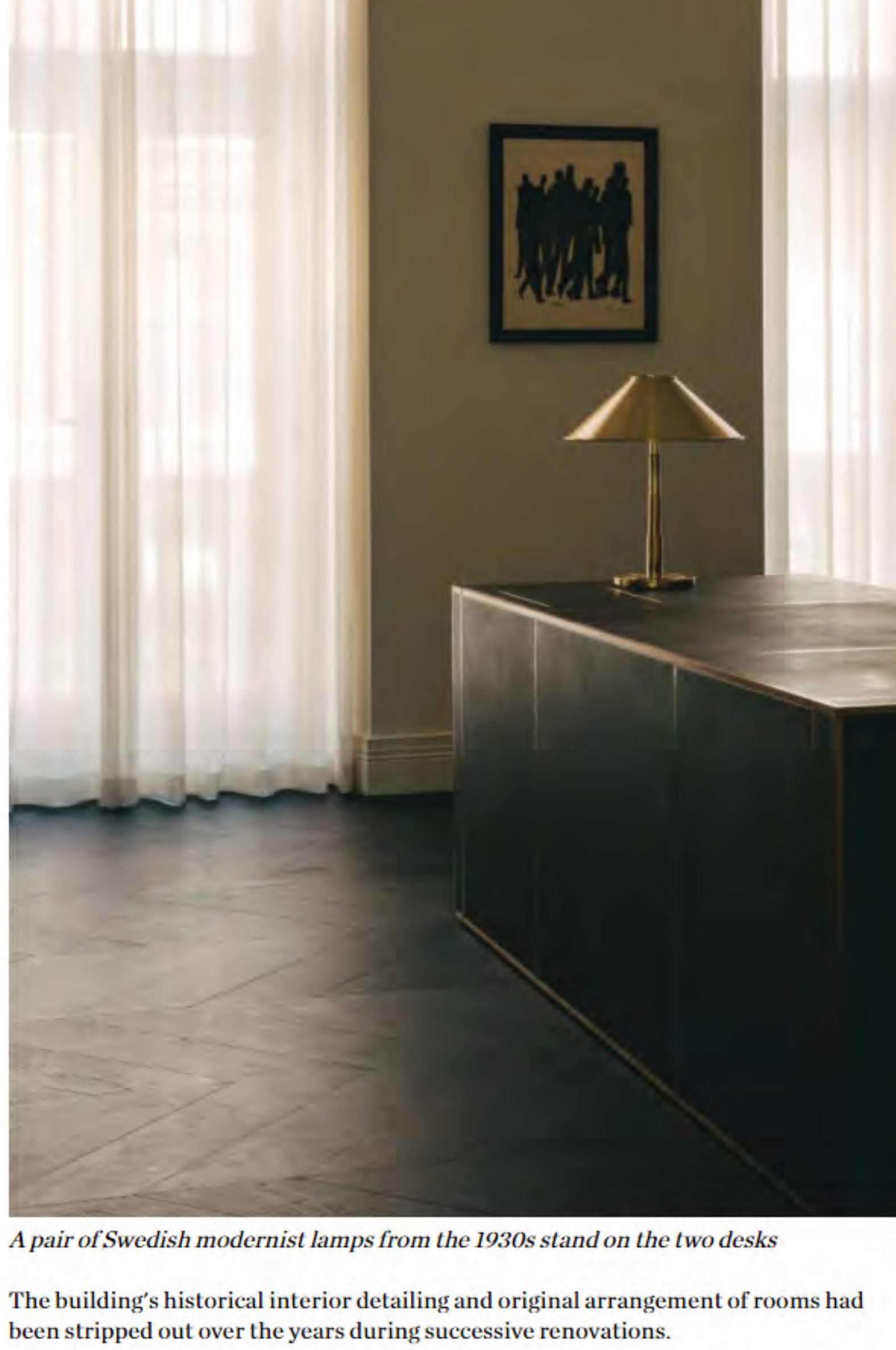
A pair of Swedish modernist lamps from the 1930s stand on the two desks

"We placed a lot of emphasis on enhancing the functional side of the office with some special antiques and design classics – like the Gino Sarfatti 1082 lamp, and the Jacques Adnet coat rack – but the brief was largely open in terms of the aesthetic and how we executed the practicalities of an office," she told Dezeen.