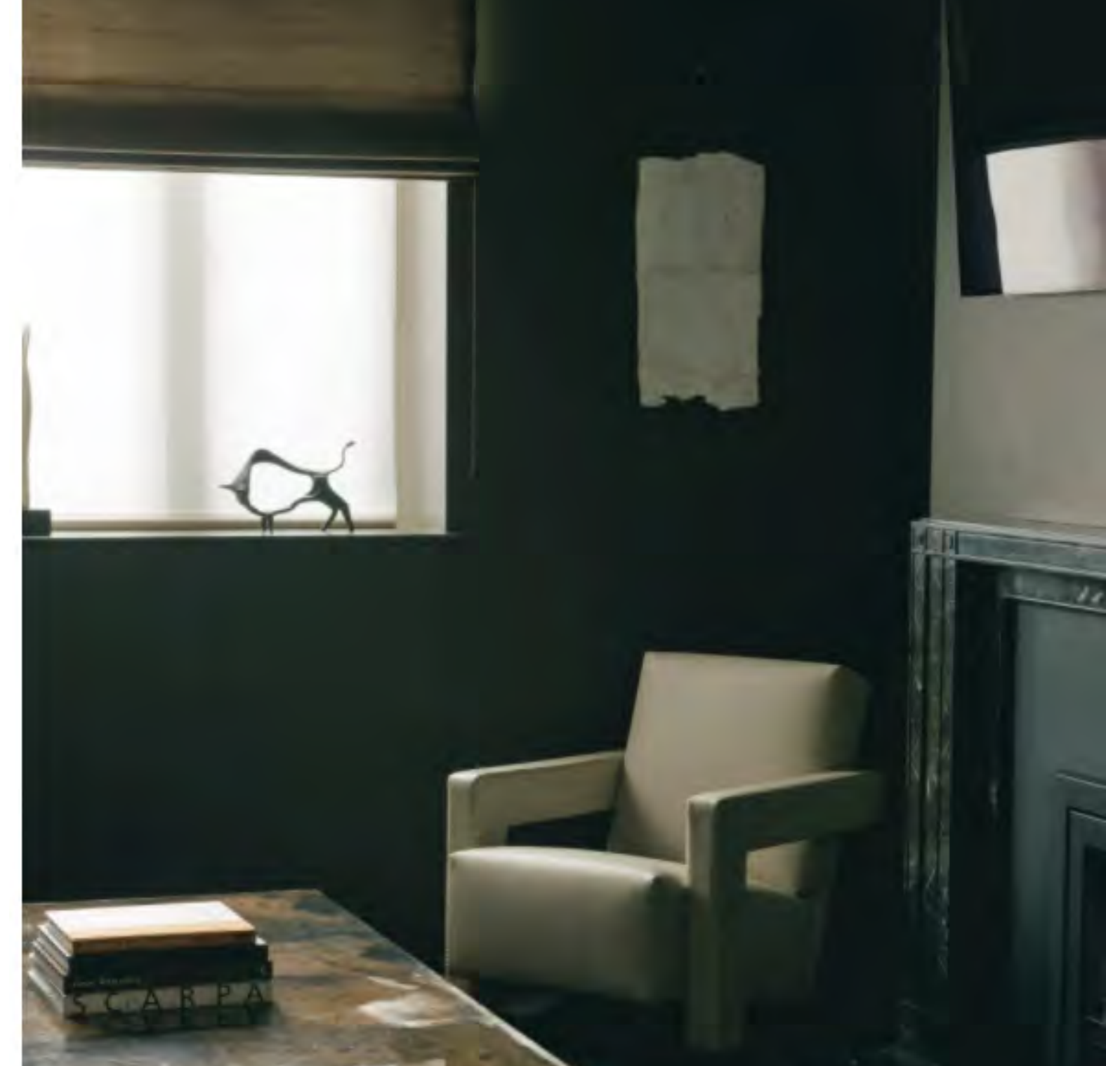
Lighter elements such as this white armchair balance out the masculinity of the space

"It was also important to reuse elements of the palette in interesting ways and make liaisons with it throughout, like the leather-wrapped pendant light by Apparatus in the ground floor meeting room."