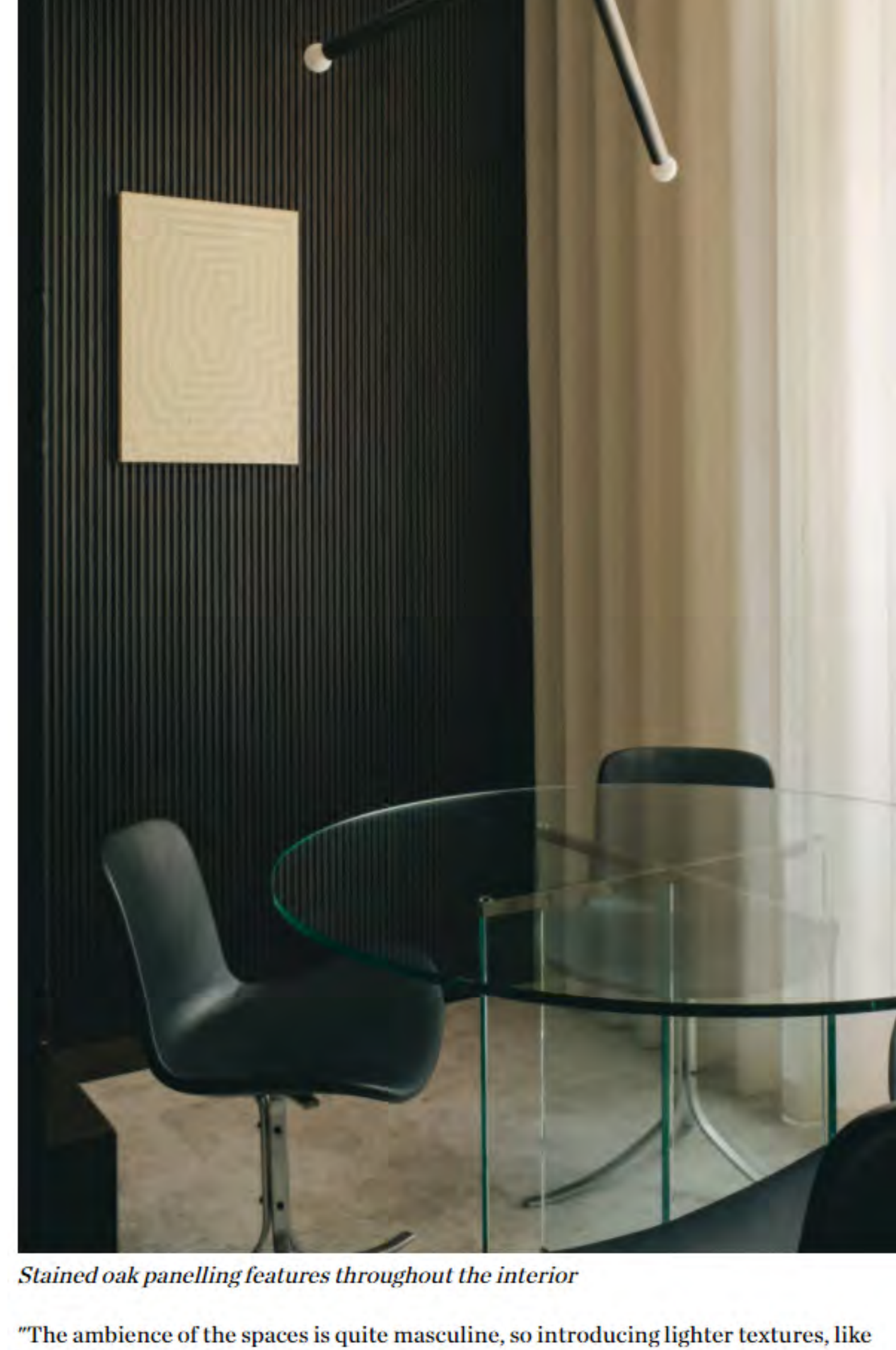
Stained oak panelling features throughout the interior

Honed grey marble was used on the ground floor to create a gentle glow. "It sits lightly in the space, and its exceptional fine detailing makes it feel seamless and calm," said Bowden.