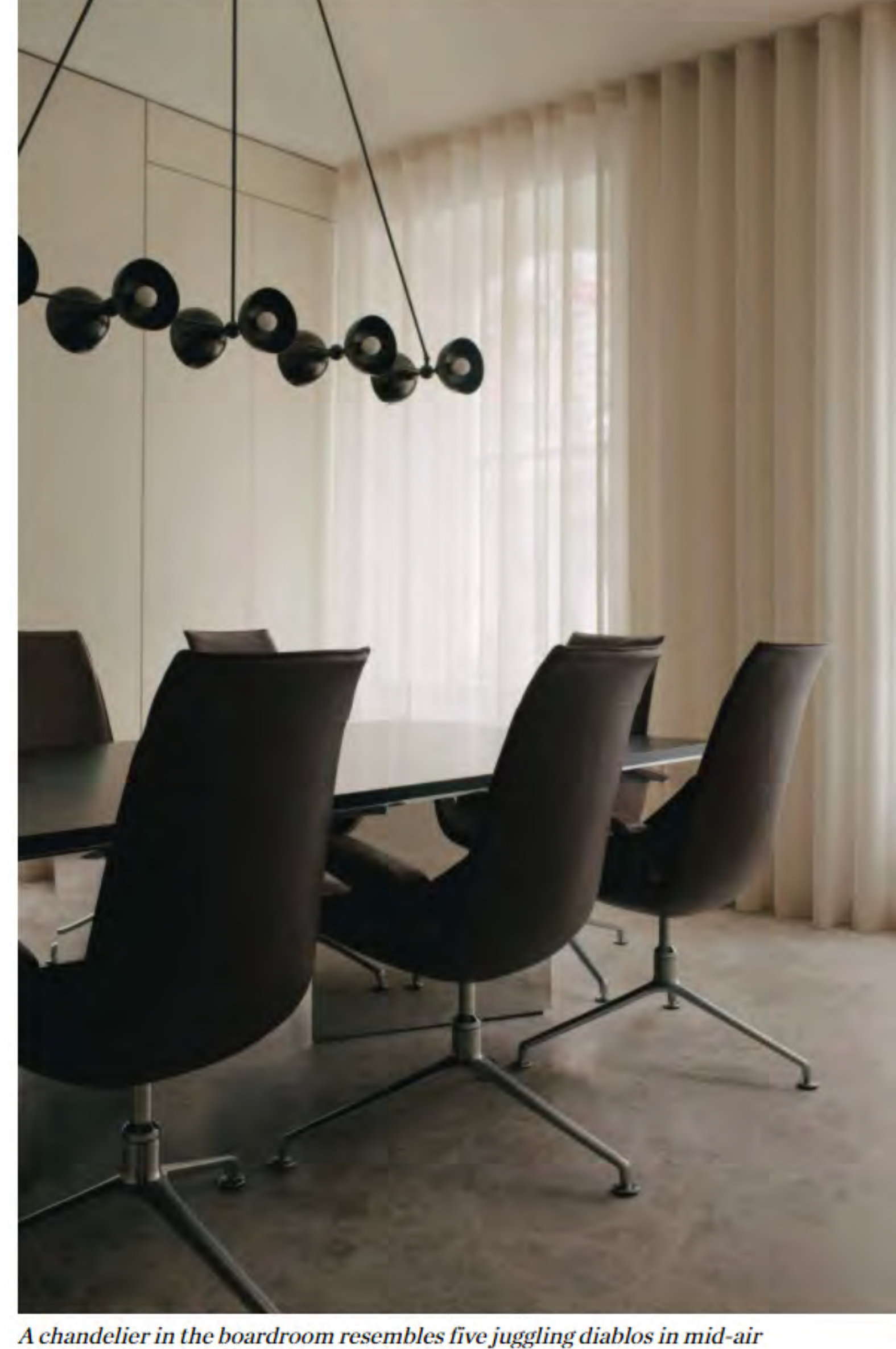
A chandelier in the boardroom resembles five juggling diablos in mid-air

"The ambience in these clubs is also rather dimly lit and the colour palette is generally muted with flashes of colour," Bowden said. "The treatment we gave this palette was the minimal detailing, which gave it a freshness and contemporary edge."