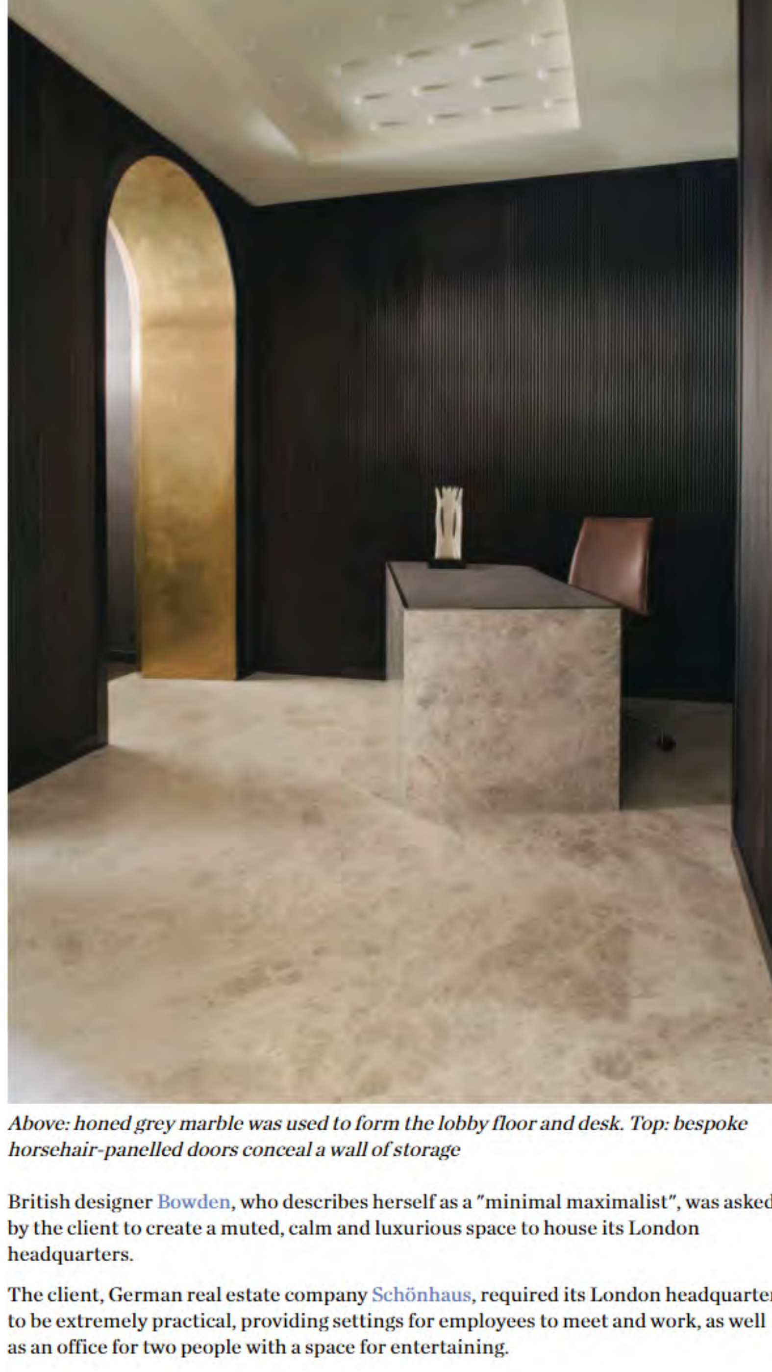
Above: honed grey marble was used to form the lobby floor and desk. Top: bespoke horsehair-panelled doors conceal a wall of storage

It includes horsehair covered cabinets, a leather and brass inlay desk and a freestanding leather bar with a brass interior.