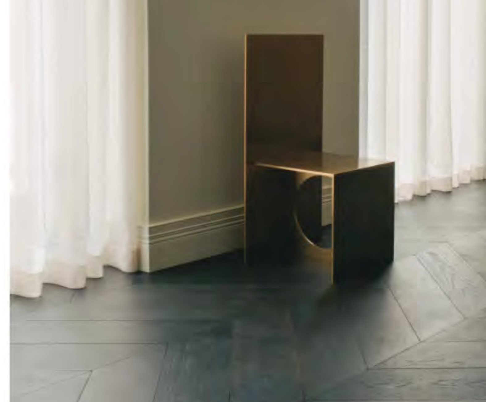
Reflective metals such as brass create the impression of being in a gentlemen's club

As a result, the ceilings were lower than a typical Georgian townhouse, providing a place for the refreshed mechanical and electrics.